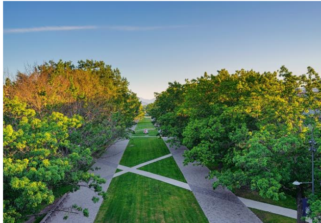
Main Mall, UBC

For continuing education, the Faculty offers a very robust set of programs throughout the year, with thousands of participants from BC, across Canada and beyond.