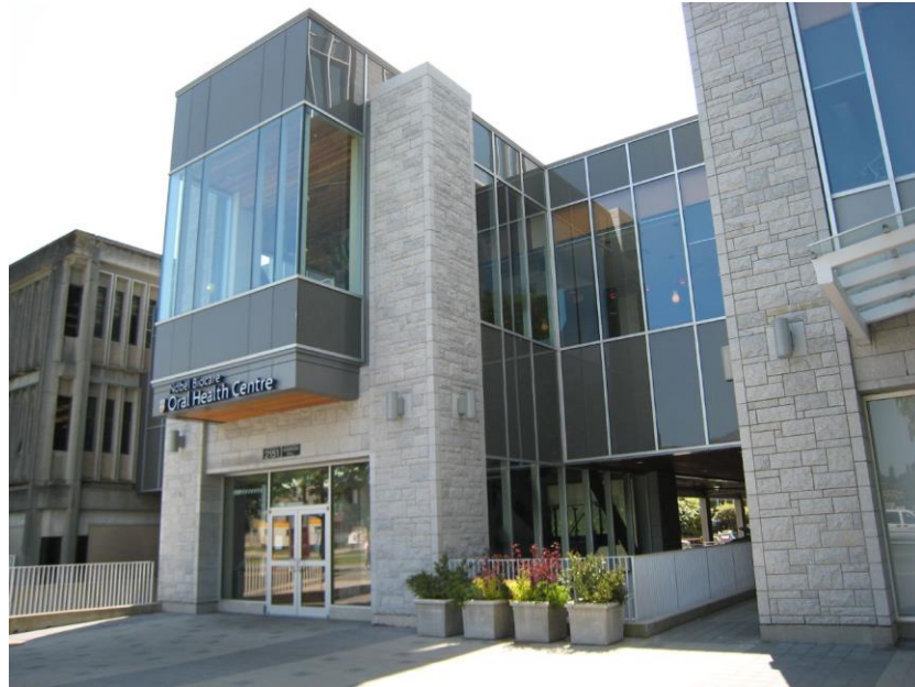
Nobel Biocare Oral Health Centre